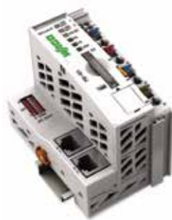
750-831 WAGO BACnet/IP Controller